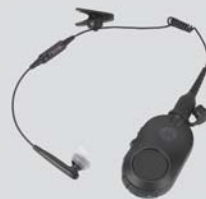
NNTN8294 (Wireless Pod not included)