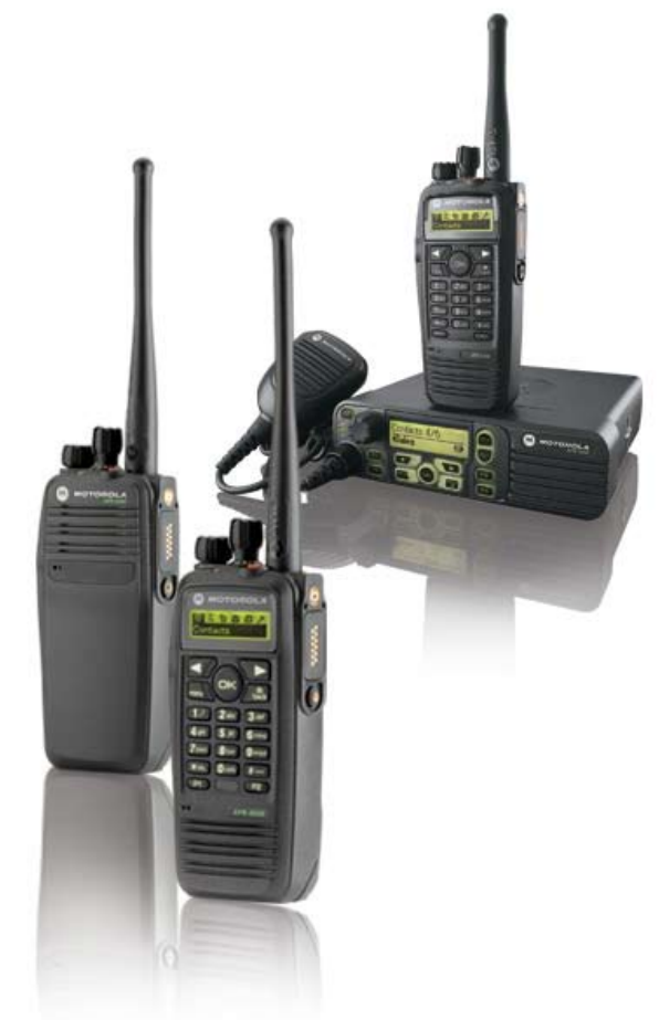
Motorola MOTOTRBO XPR Digital Radios

The MOTOTRBO radios have significantly improved audio quality over the aging analog system. "The hotel staff uses the radios in some high noise areas, such as the kitchen, laundry room, engineering room and on the loading dock," says Holt. "With the crisper audio of the MOTOTRBO radios and the headsets with noise suppression capability, they can now hear clearly without having to repeat themselves several times like before."